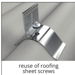
reuse of roofing sheet screws